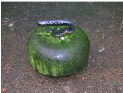
Old time Curling Stone

Did you watch the 12 days of Curling at the Olympics? Were you as fascinated with those silvery stones sliding down the ice, bashing one another, slipping by each other seeking to be last and best? The curling stone is granite and is defined by the World Curling Federation: "it is circular in shape and weighs between 38 and 44