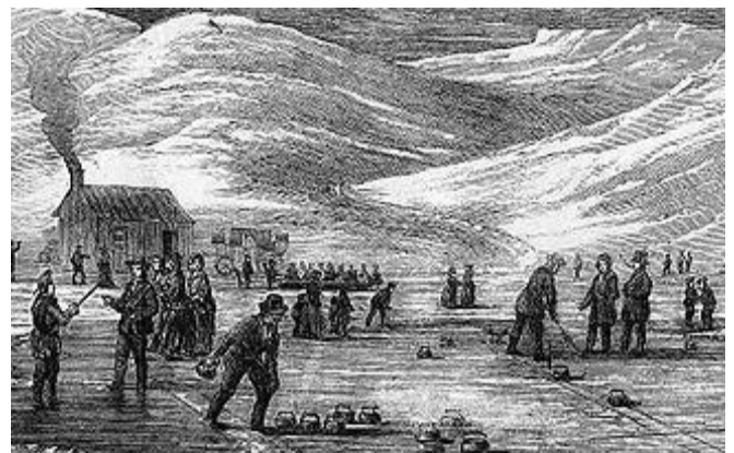
Fingast Curling Club Scotland 1854