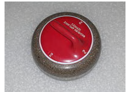
Modern granite curling

Did you watch the 12 days of Curling at the Olympics? Were you as fascinated with those silvery stones sliding down the ice, bashing one another, slipping by each other seeking to be last and best? The curling stone is granite and is defined by the World Curling Federation: "it is circular in shape and weighs between 38 and 44